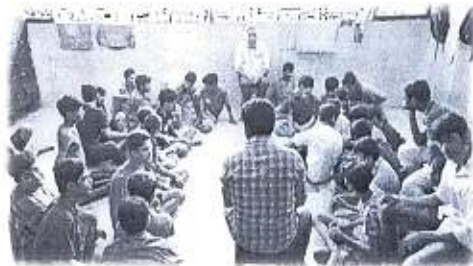
The photograph shows the older children sharing their experiences with new children, to increase their motivation to stay at the centre.