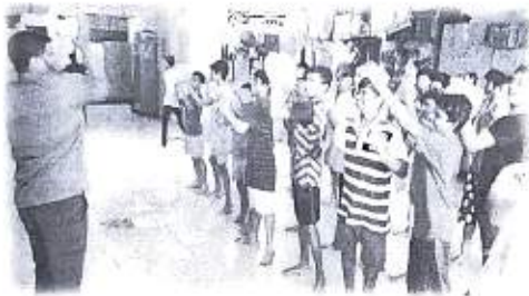
The children doing P.T. in the centre

participated in group sessions and are encouraged by other children to take part in the various activities at the centre often, the children share their past life in the group. Prayers and the Pledge to give up drugs are also part of the sessions.